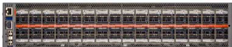
Arista 7060X6-64PE: 64 x 800 GbE OSFP ports, 2 SFP+ ports

Coupled with Arista EOS, the 7060X6 smart switch delivers advanced features for hyperscale networks, server-less compute, big data farms and AI clusters. Scalability, high bandwidth, low latency, traffic management and prioritization, network security, rich telemetry and instrumentation are the cornerstones for the next generation networks.