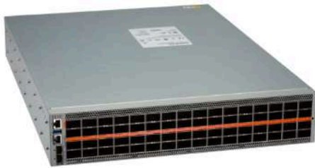
Arista 7060X6-64PE: 64 x 800G OSFP ports, 2 SFP+ ports

The 7060X6-32PE delivers 32 800G ports in a 1RU system with an overall throughput of 25.6 Tbps. The system also has 2 dedicated SFP+ data plane ports. The 7060X6-32PE offers OSFP interfaces, supporting industry standard optics and cables allowing for ease of migration to 800G. All ports allow a choice of speeds including 800 GbE, 400 GbE, 200 GbE or 100 GbE, up to 256 interfaces.