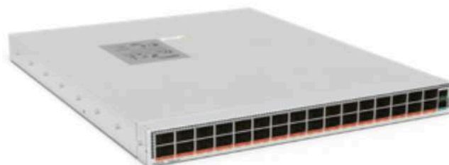
Arista 7060X6-32PE: 32 x 800 GbE OSFP ports, 2 SFP+ ports