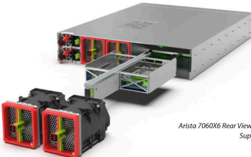
Arista 7060X6 Rear View: Accessing the field replaceable Supervisor card

The Arista 7060X6 series also uses a novel approach for the field replaceability of its components, in the 2RU variants. The Supervisor card can be field-replaced, accessing it by removing the two right-most fan units. This offers several benefits, particularly in terms of simplified maintenance, reduced downtime, increased flexibility, lower TCO, and improved reliability. This state-of-the-art design facilitates robust operational efficiency.