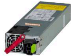
2.4kW Hot swap power supplies